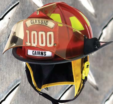
Classic 1000™ Helmet Ballistic protection for extreme conditions

Choose Cairns: Millions of firefighters for generations have!