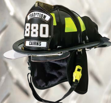
880 Tradition® Helmet Lightweight, low-profile performance