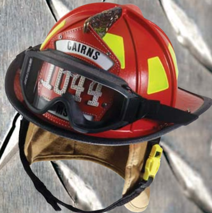
Cairns 1044™ Helmet Rugged design, everyday toughness