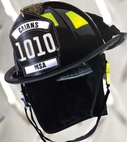
Cairns 1010™ Helmet Superior balance in a classic design